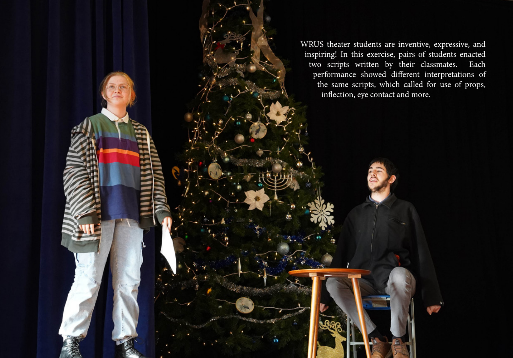
WRUS theater students are inventive, expressive, and inspiring! In this exercise, pairs of students enacted two scripts written by their classmates. Each performance showed different interpretations of the same scripts, which called for use of props, inflection, eye contact and more.